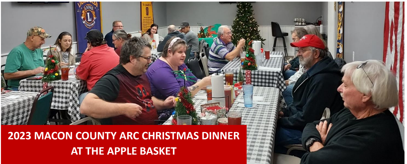
2023 MACON COUNTY ARC CHRISTMAS DINNER AT THE APPLE BASKET